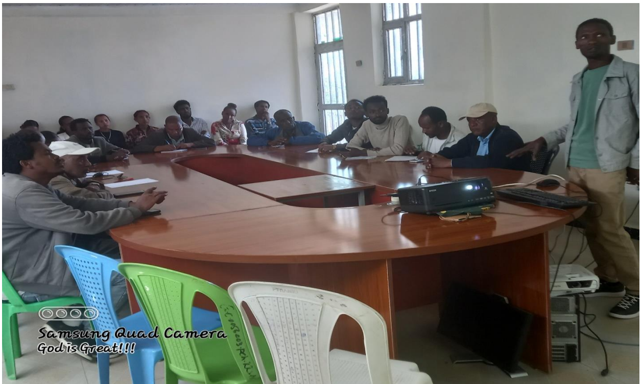
2. A capacity Building Training Conducted on January 10, 2025 on the title of “Customers handling & Change Management” both for Academic & Administrative Staff of Global College, Ambo